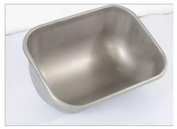
SMOOTH SURFACE Durable, resistant to corrosion, resistant to falling