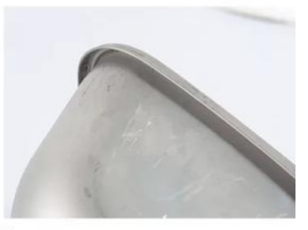
CRIMPED DESIGN Crimped design, smooth and wear-resistant, does not hurt the pig's mouth

Qingdao DEBA Brother Machinery Co.,Ltd. Phone:+86-18562870982 E-mail:info@debabrother.com.cn