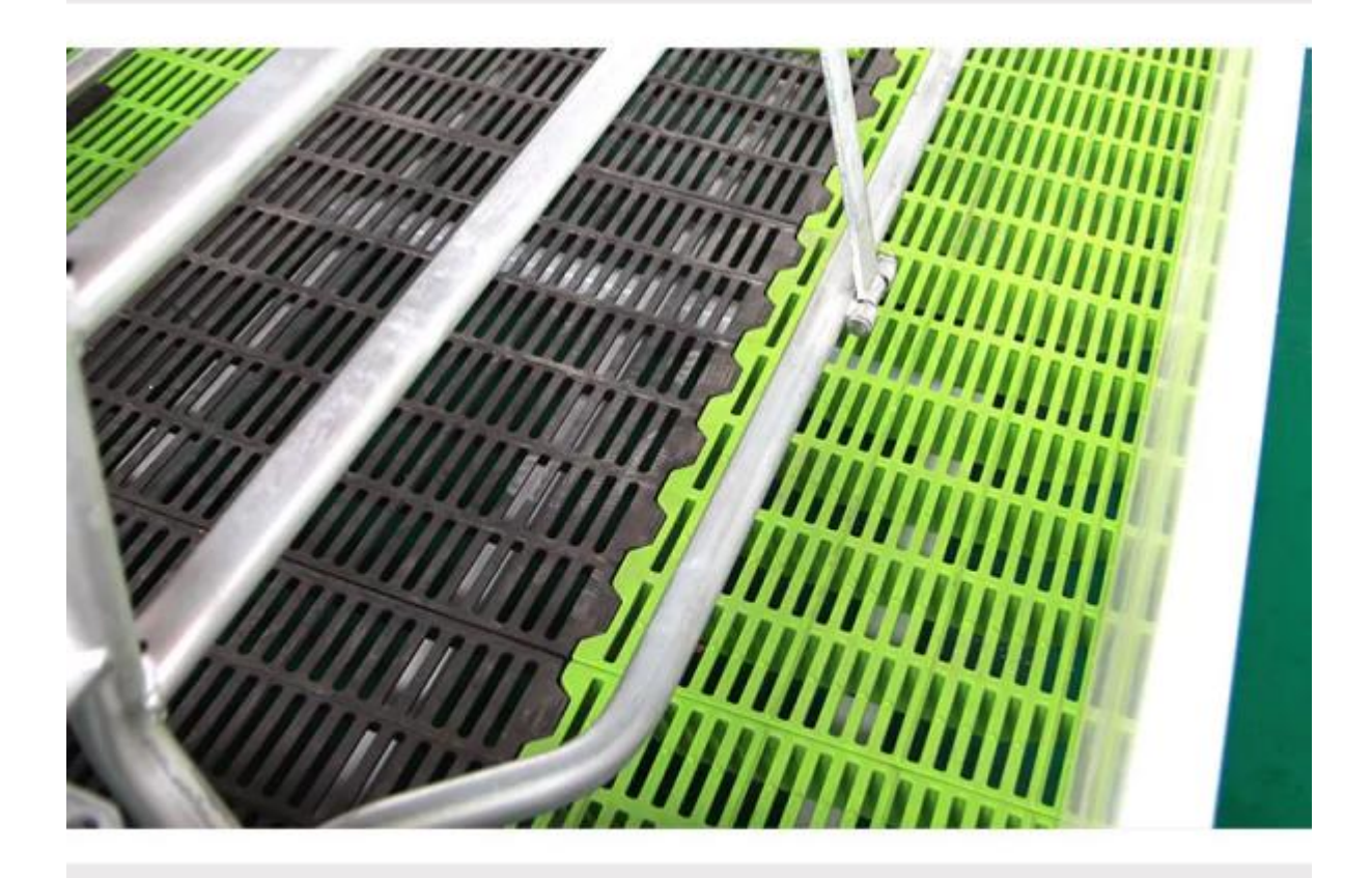
Plastic floor materials are mostly on, light weight, easy

Anti-aging, anti-corrosion, long service life, PP, no doping