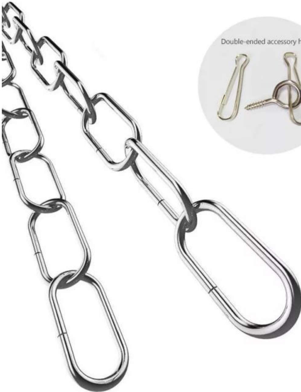
Double-ended accessory hook